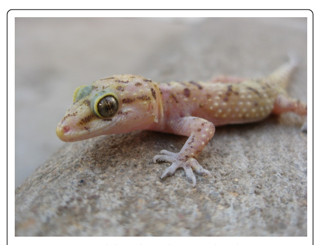
Figure 1 Mature adult male gecko ( Hemidactylus turcicus ) . In July 2010 in Mourão, southern Portugal.

described for continental Portugal: Tarentola mauritanica and Hemidactylus turcicus [42]. The latter has a restricted distribution area in Portugal, and is listed as "Vulnerable" according to the Portuguese Vertebrate Red List [51]. Both species are protected by the Portuguese law, under the transposition of Bern Convention on the Conservation of European wildlife and habitats. The most common predators of H. turcicus and T. mauritanica are snakes, owls, domestic cats, hedgehogs, genets, and rats [50]. Both T. mauritanica and H. turcicus suffer from human persecution due to public misconception [37,52] while the latter are also probably affected by an ongoing loss and degradation of habitat [51]. There is still also a currently paucity of biological and ecological data regarding both species in terms of their presence in Portugal [42], since few studies were completely dedicated to study these species in the country. T. mauritanica and H. turcicus may, in certain locations, live sympatrically in open to semi-open landscapes, but are also occasionally found in areas more densely covered by vegetation. Preferred habitats are slopes and stream and river valleys where a multitude of natural and/or artificial crevices provide rocky structures [50,53]. Both species may also be found far from any water bodies, and even deep within human settlements on tree trunks and other vegetative cover [50,53].