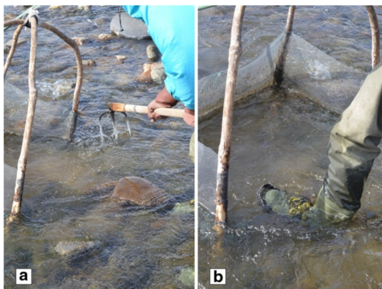
Fig. 3 Fishing zazamushi: a turning stones upside down, b “trampling” the riverbed with metal shoes.

A fisherman progresses through a few square meters of the river in this way each day and can prospect an area of about 20 square metres in a morning, if the stones are not too large and if the weather conditions are good, or over a full day if the weather is bad and the stones are large. If the site promises more abundant catches, the fisherman will come back the following day, slightly upriver from where he had prospected the previous time. At the end of a rapid, or of a section of river, the fishermen follow parallel lines to either side of the main line of the rapids. Once the rapids of a site have been prospected, the fishermen change site and don't come back to this one for the rest of the season.