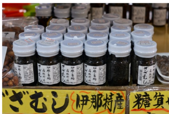
Fig. 6 Zazamushi are cooked with sugar and soy sauce and packaged. A glass bottle contains approximately 30 g of insects

various elements received have been modified and adapted by the new owner. The metal equipment such as the four-hand net, metal shoes and graders, are made by the fisherman or commissioned from craftsmen. Thus, it is common for a fisherman's idea for improving his own equipment to be taken on by another.