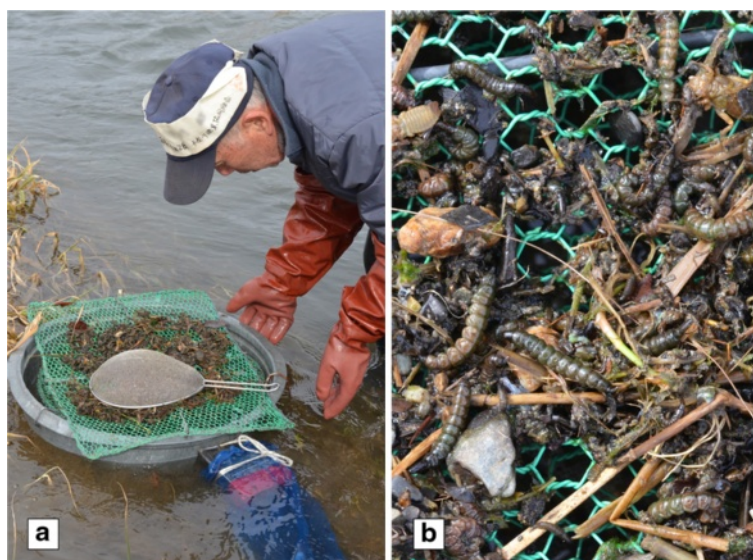
Fig. 4 Processing zazamushi: a the catch is spread on the first sieve of the grader, b the catch is composed of mixture of insects, debris and detritus.

which 58.18 % of Ephemerellidae), but also larvae of Coleoptera (Psephenidae, 14.83 % of the insect biomass) and of Trichoptera (Hydropsychidae, 11.12 % of the insect biomass, see Table 5). Boiling then rinsing can be repeated a second time, even a third if the fisherman or the trader considers that the insects still contain detritus.