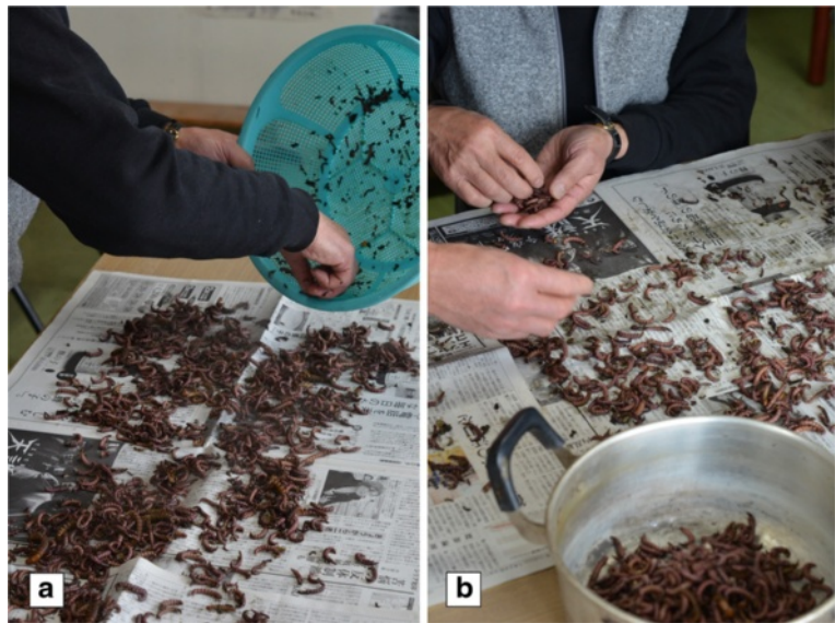
Fig. 5 Processing zazamushi: a after boiling and cleaning, the insects are spread to be sorted a final time by size and quality, b the insects still contain small debris and detritus.

stones in particular has prompted the fishermen to use other tools, such as the hoe and to develop new techniques for gathering and sorting, such as the grading sieve. Indeed, if the use of the four-hand net in riffles has multiplied the quantity of insects caught, it has also had the collateral consequence of increasing the amount of “trash” collected, including many insects other than the target species.